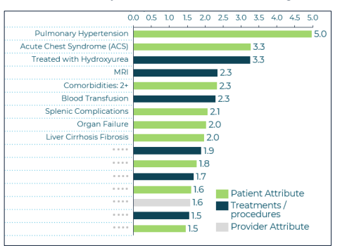
Figure 2: Clarify's linkage to national datasets defined volumes of patients with matching profiles, but not currently on the drug

Figure 1: Clarify Growth identified the top attributes highly-correlated with patients who would most likely benefit from the new drug